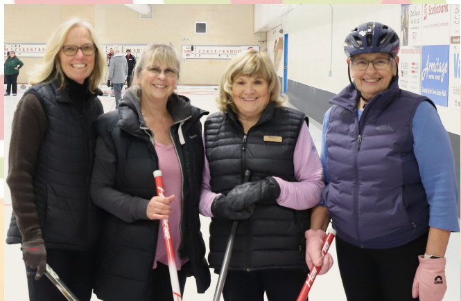
Ladies A Runner-up: Team De Vita From Powell River Curling Club