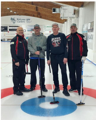
Congratulations to the Pagani Team who won the C Event.